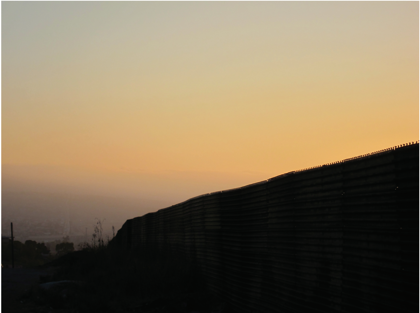
Photo Archive, along the original fence between Mexico and US, 2012