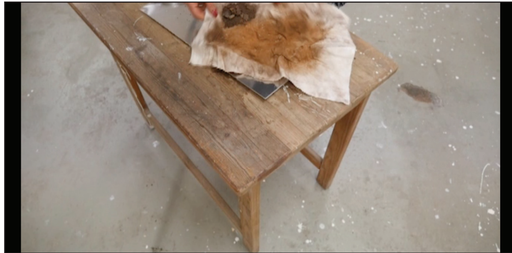
Video still from the project InDustWeTrust: video statement of the constant production of Border Pigment.