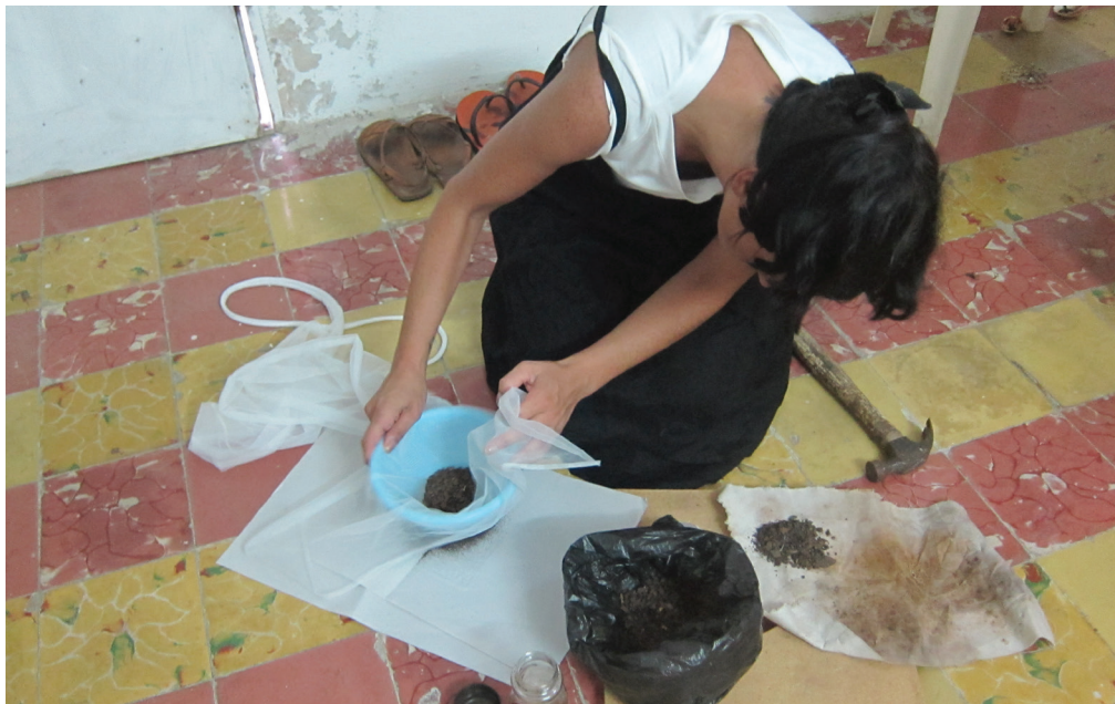
Photo Archive, first production of Border Pigment, Yucatan, 2011.