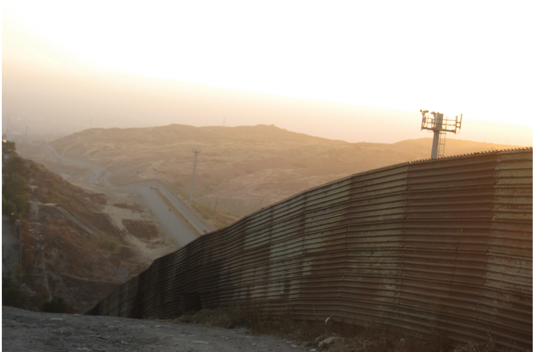
Photo Archive, along the original fence between Mexico and US, 2012